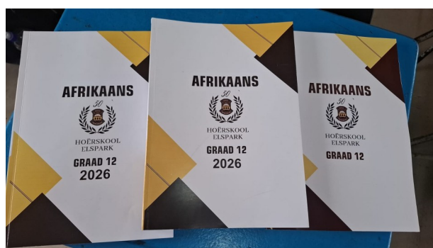
GR.12 TEXTBOOKS: Language textbook, Drama textbook & Poetry textbook