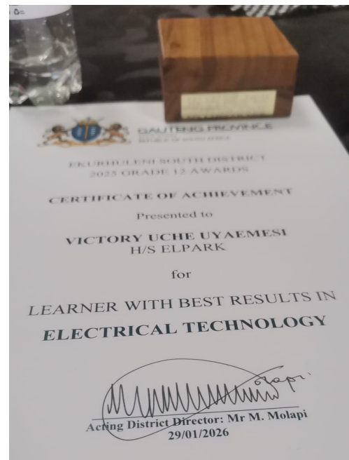
Above: Victory Uche Uyaemesi Certificate of Excellence